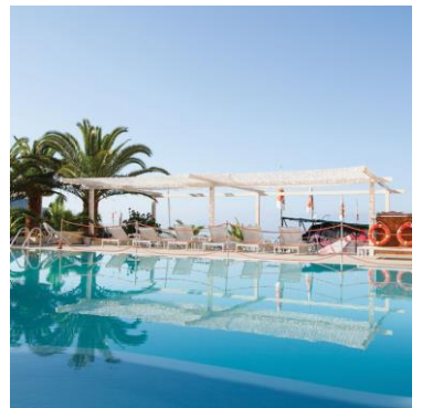
Cosmos Beachclub , Greece Great for windsurfing and mountain biking.