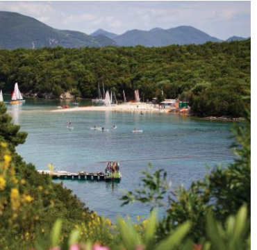
Retreat Beachclub, Greece Great for water skiing, mountain biking and kayaking.