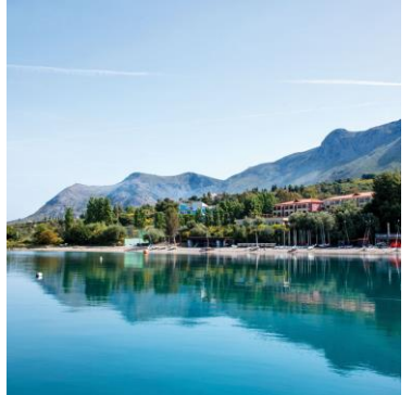
Vounaki Beachclub , Greece Great for sailing, water skiing and mountain biking.