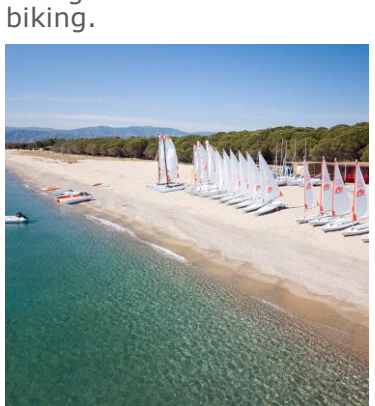
Airone Beachclub , Italy NEW Great for sailing, tennis and road cycling.