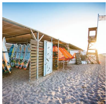
Messini Beachclub, Greece Great for tennis, mountain and road biking and sailing.