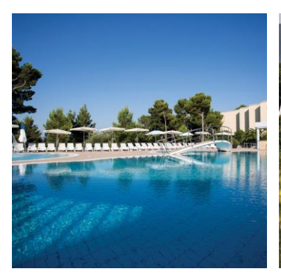
Alana Beachclub , Croatia Great for dinghy sailing, spa, tennis and climbing.