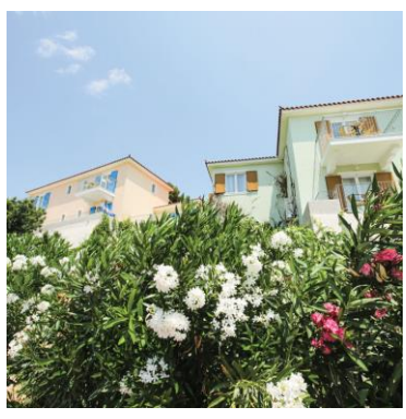
Aeolian Village Beachclub , Greece Great for sailing, windsurfing and mountain biking.